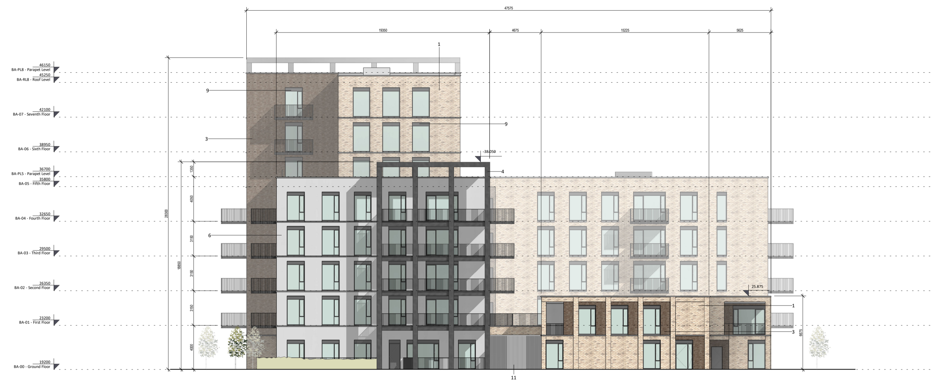
2 BA-East Elevation 1:200