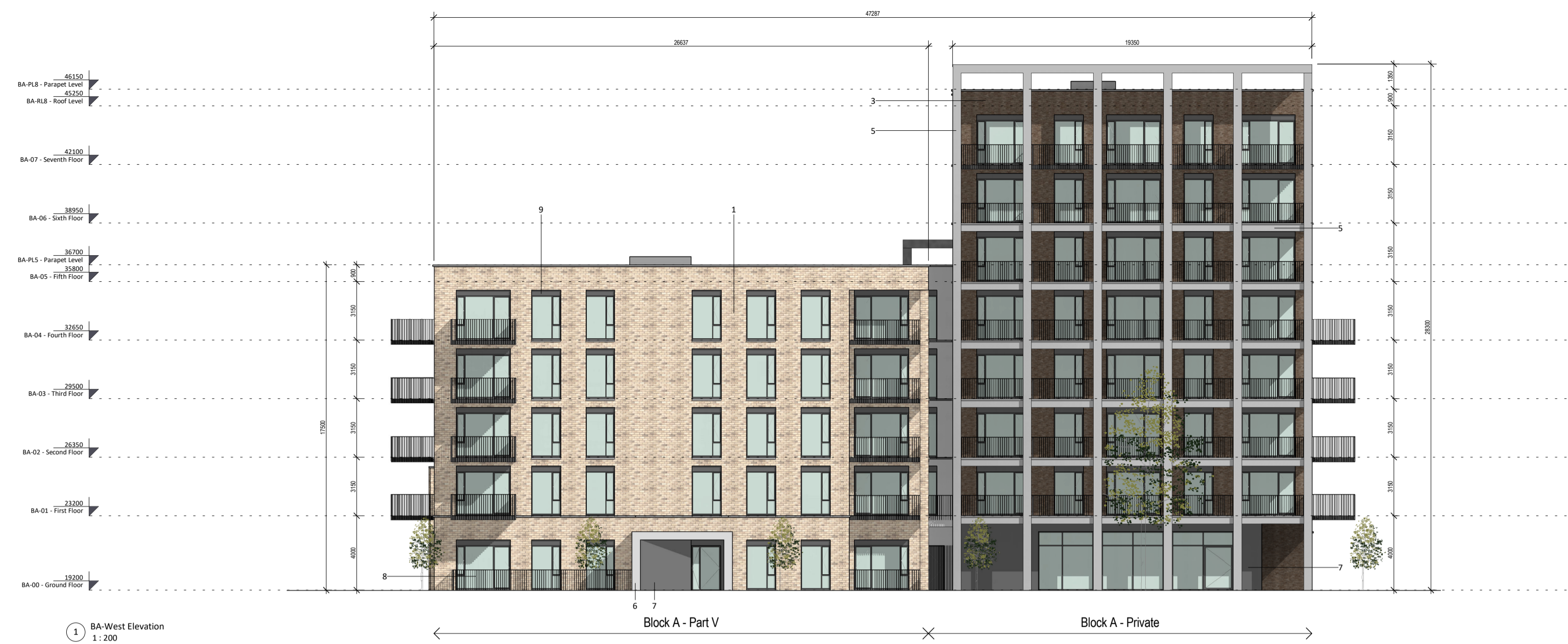
1 BA-West Elevation 1:200