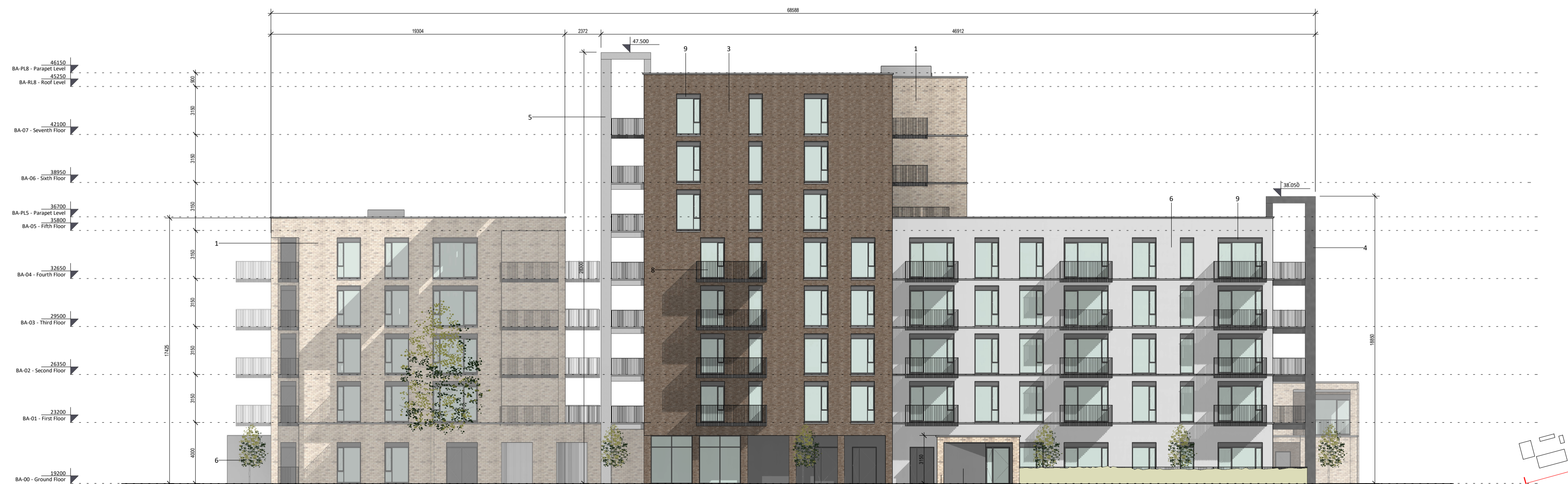
3 BA-South Elevation 1:200